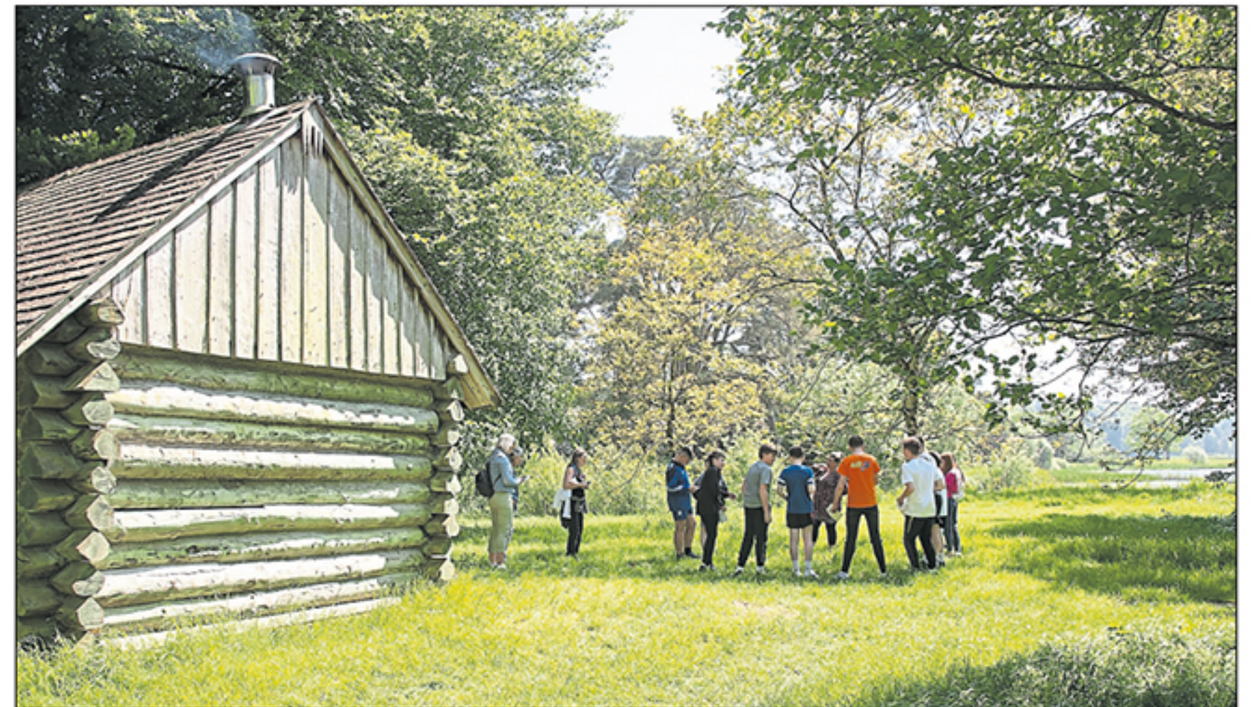
Students from the two Omagh schools get to know each other. JasMc11